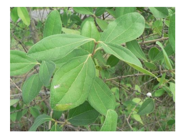
Figure 1. Strychnos innocua, showing the leaves and branches

Strychnos innocua fruits have been studied for their nutritional, antinutritional, and chemical composition [8-10]. This study aimed to use GC-MS to determine a root bark methanol extract's chemical composition and antifungal activity against Candida krusei .