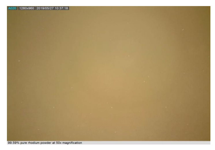
Figure 2. Optical microscopy image of 99.59% rhodium solution at magnification of 50x

As can be seen from the Table 2, these results give unsatisfactory dissolution. Given that there is a visible black residue in all cases, the rhodium dissolution is definitely incomplete. Moreover, since the rhodium powder doesn't dissolve, it is not possible to draw any qualitative inference regarding the rhodium content in the powder from the color of the solution.